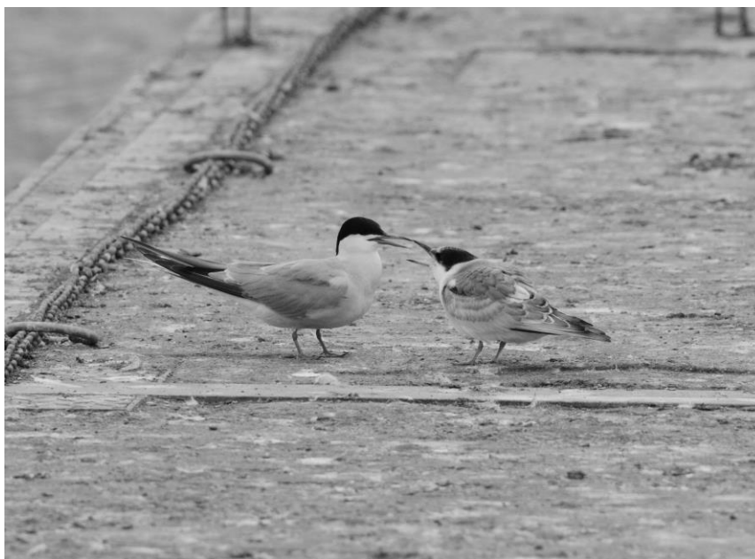
Breeding Common Terns at Chelmarsh Reservoir.