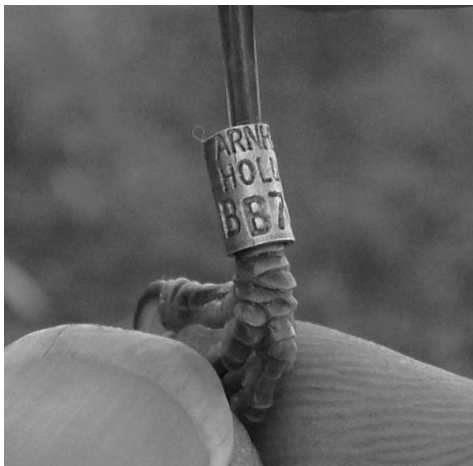
A Netherlands ring on a migrant

More information on this trip and the rest of the Brewood RG's work, including ringing demonstrations and their other overseas project in northern Norway, can be found on their website: www.brewoodringers.com